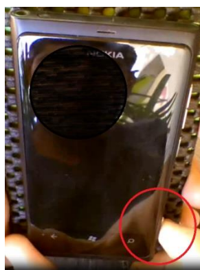
Figure 4: Camera button on the Windows Phone is confused with the power button.

All behaviors mentioned in the three systems have been influenced in one of the performance metric, the "number of errors", according "2.2 Usability Metrics".