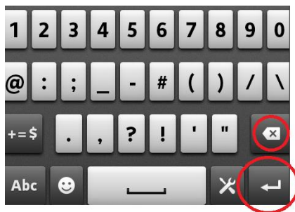
Figure 2: Confusing enter and backspace metaphors on the Android.

Some failures and similar behavior during task execution between user groups were identified for each operating system. Some of these tasks failures weren't shown since they were not relevant evidence on this case study. It was noted that in the Android system the main failures of similar behavior refers to the metaphors used for the enter and backspace buttons that confused users (Figure 2) when typing a message, regardless of the user group: 25% of them were confused by these buttons (Table 3).