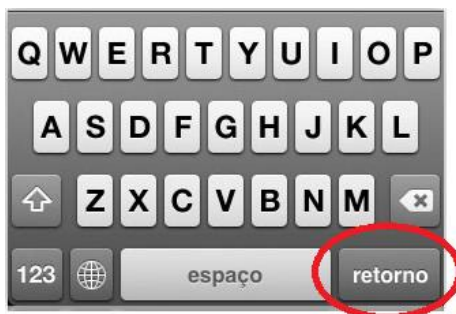
Figure 3: The word “return” or “retorno” confuses users into thinking they will return to an earlier screen or to an earlier operation on the iOS.

The task of returning to the home screen showed the problem of the word "return", which has the function of scrolling down to the line below or enter , i.e. , 55% of users made this mistake (Table 4). As a recommendation for this and other systems, changing the word "return" or "retorno" in Portuguese to "enter" may reduce this percentage of errors (Figure 3).