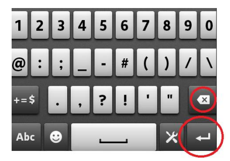
Figure 2: Confusing enter and backspace metaphors on the Android.

Some failures and similar behavior during task execution between user groups were identified for each operating system. Some of these tasks failures weren't shown since they were not relevant evidence on this case study. It was noted that in the Android system the main failures of similar behavior refers to the metaphors used for the enter and backspace buttons that confused users (Figure 2) when typing a message, regardless of the user group: 25% of them were confused by these buttons (Table 3).