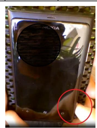
Figure 4: Camera button on the Windows Phone is confused with the power button.

All behaviors mentioned in the three systems have been influenced in one of the performance metric, the "number of errors", according "2.2 Usability Metrics".