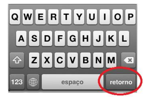
Figure 3: The word "return" or "retorno" confuses users into thinking they will return to an earlier screen or to an earlier operation on the iOS.

The task of returning to the home screen showed the problem of the word "return", which has the function of scrolling down to the line below or enter , i.e. , 55% of users made this mistake (Table 4). As a recommendation for this and other systems, changing the word "return" or " retorno " in Portuguese to "enter" may reduce this percentage of errors (Figure 3).