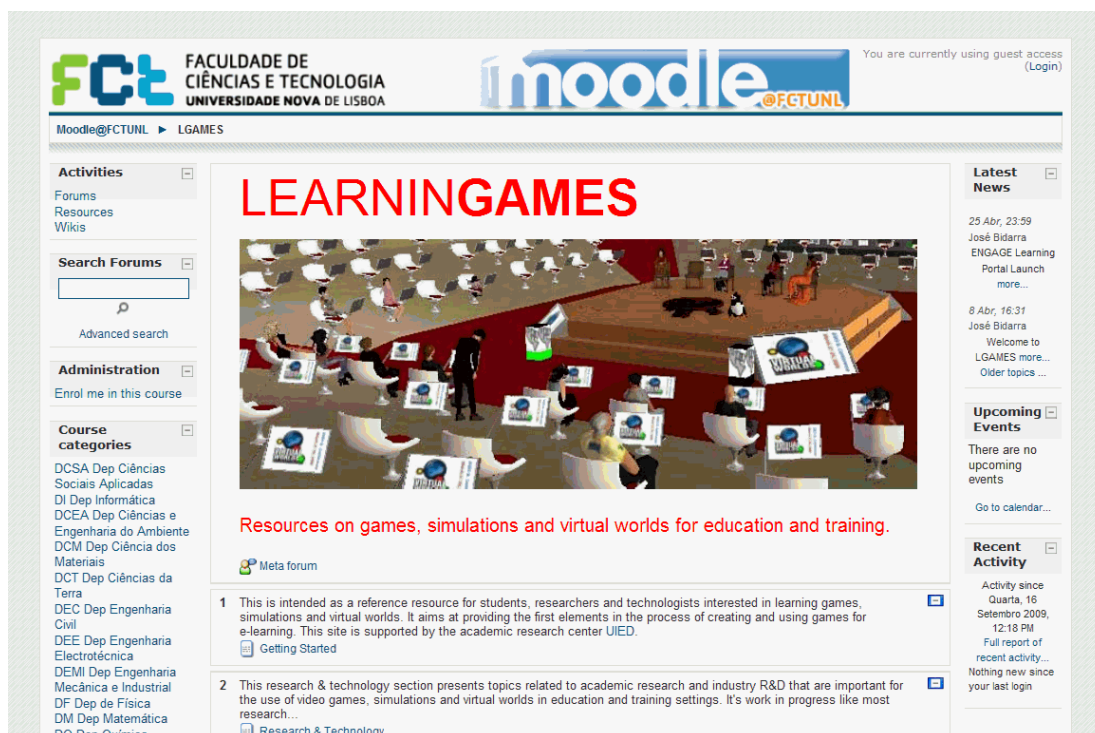
Figure 2. Site developed during this study - LEARNINGGAMES at FCT-UNL: http://moodle.fct.unl.pt/course/view?id=2176

In summary, games, simulations, and virtual worlds can serve multiple educational purposes, but a more sustained approach is required, in which specific game genres are identified and suitable frameworks are set to facilitate the provision of educational games in such genres. We tried to address this need in a concise and schematic way by developing a site with resources and references (Fig 2).