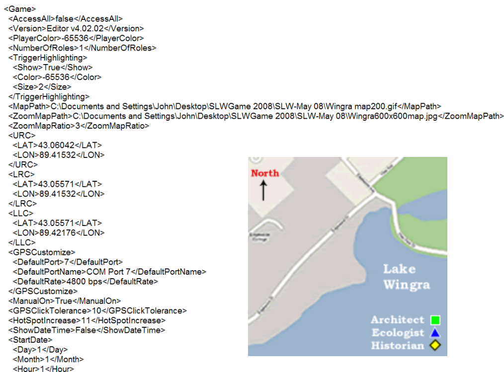
Figure 3. Screen Layout and XML script of AR game developed at ADL Co-Lab